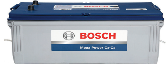
Image is generic & may vary to actual product

Passenger Vehicle Light Commercial Vehicle