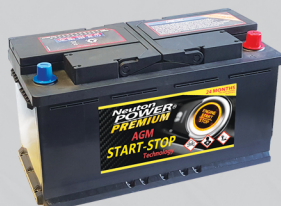
Start-Stop Range EFB/AGM Battery