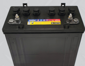
Golf Carts & Scissor Lifts Deep Cycle Battery