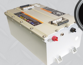
Evolution Lithium Battery For Golf Carts, Personal Use & Commercial Use