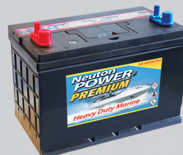
Marine & Recreational Dual Posts