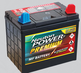
Lawn Mower Range Starting Battery