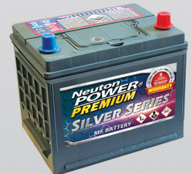
Silver Range Premium battery - Sealed Expanded Calcium MF