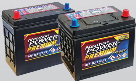
Neuton Power Car Battery Sealed Expanded Calcium MF