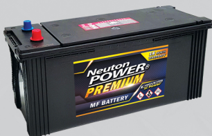
Commercial Vehicle Truck - Accessible Cell