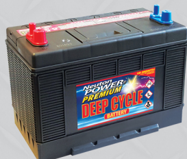
Deep Cycle Range Deep Cycle Flooded Battery