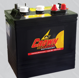
Heavy Duty Deep Cycle 6V, 8V & 12V Series