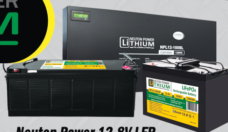
Neuton Power 12.8V LFP - Bluetooth(BT)/Slimline (SL) Series LiFePO4 Rechargeable Battery