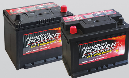
Neuton Power K Battery Punched Positive & Expanded Negative Plate